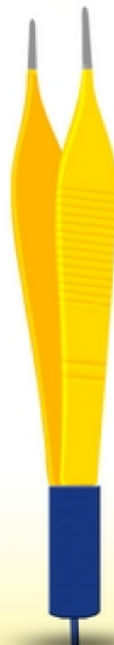
ADSON FORCEP 120 MM